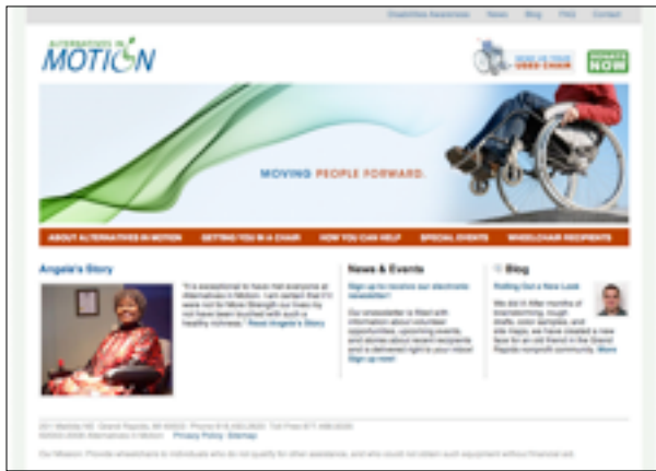
Log on: www.alternativesinmotion.org